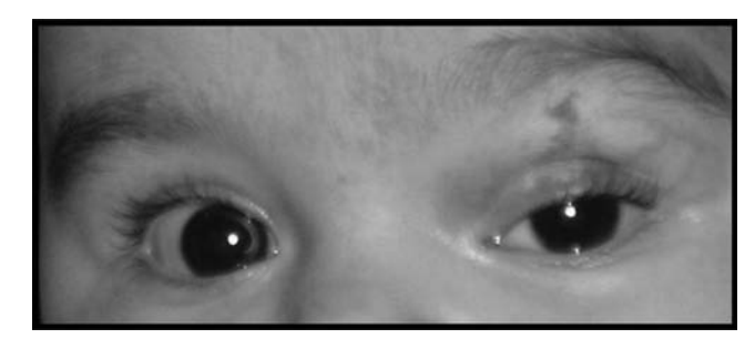
Fig. 3. The patient aged 43 weeks showing the residual bulk of the haemangioma following steroids.

At 22 weeks occlusion was reduced to 4 hours a day, and vision was right: 6.5 cy/cm, left: 4.8 cy/cm. Oral steroids were stopped.